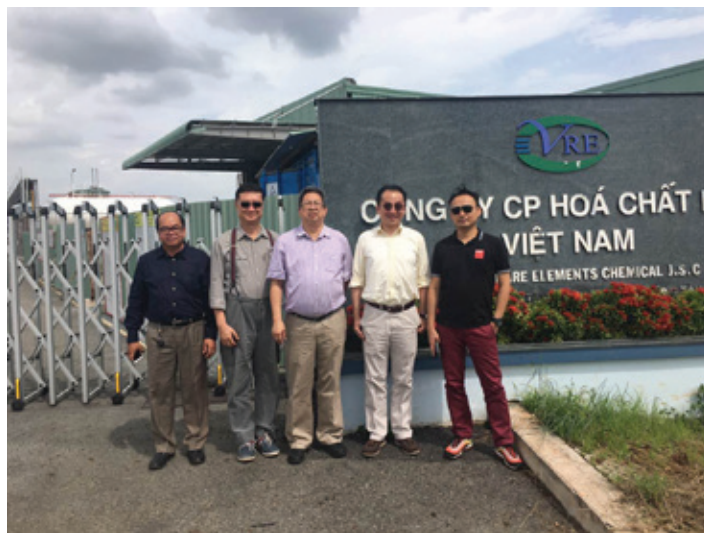
Vietnam site visit by KEG team and business partner