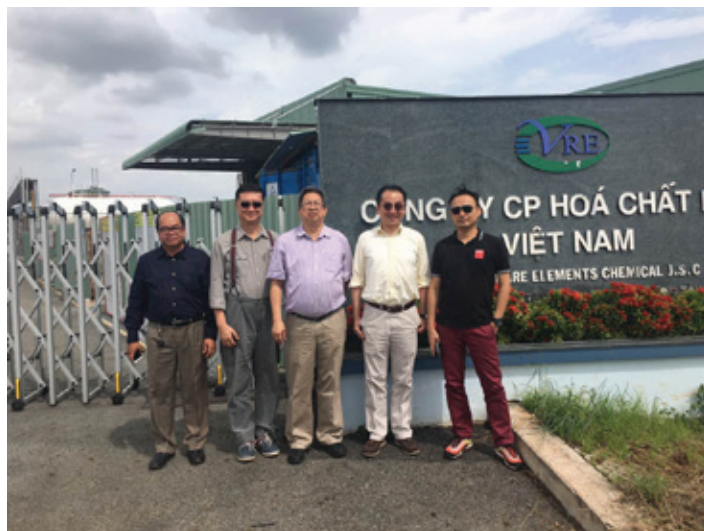
Vietnam site visit by KEG team and business partner