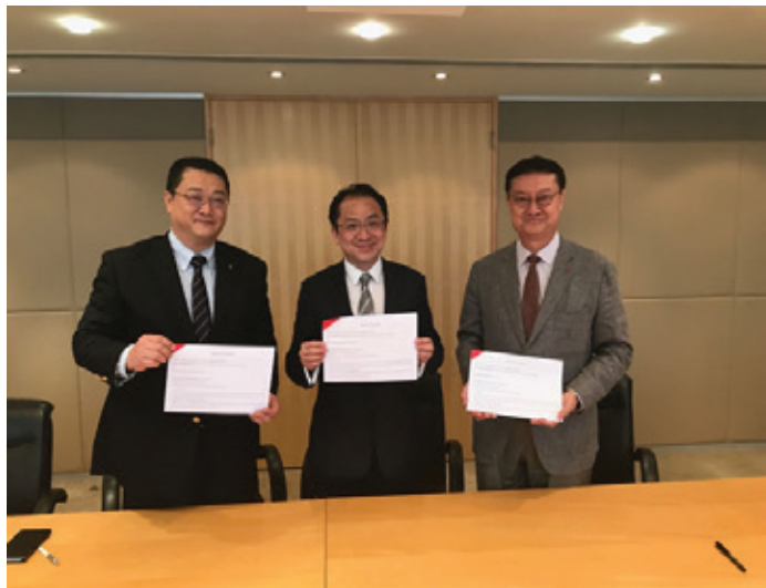
Signing of MOU by KEG, DKKK and the Vietnam manufacturer.