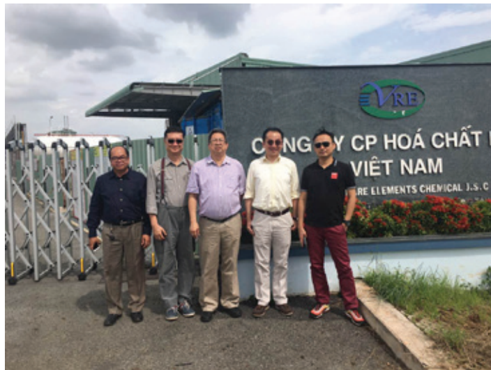
Vietnam site visit by KEG team and business partner