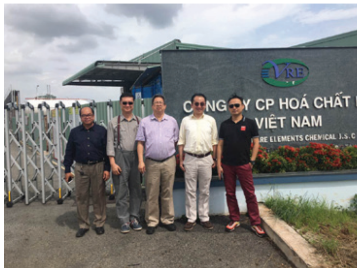
Vietnam site visit by KEG team and business partner